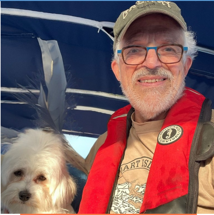
Chilling with Whidbey