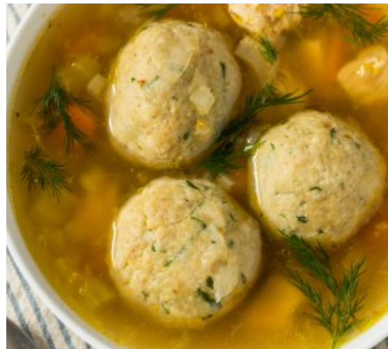
Matzo Ball Soup