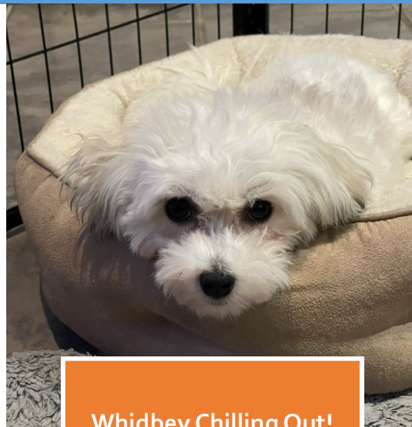
Whidbey Chilling Out!